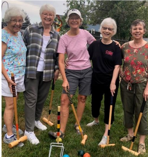
LOL has "wicket" fun!

Can LOL support new participants??? Yes!! A new program year will officially kickoff on Wednesday, October 4th at 9 a.m. at Holy Trinity. The session will be devoted to sharing life stories that one cannot help but laugh at. Bring your coffee and join in or just sit back and enjoy. No pressure. No expectations.